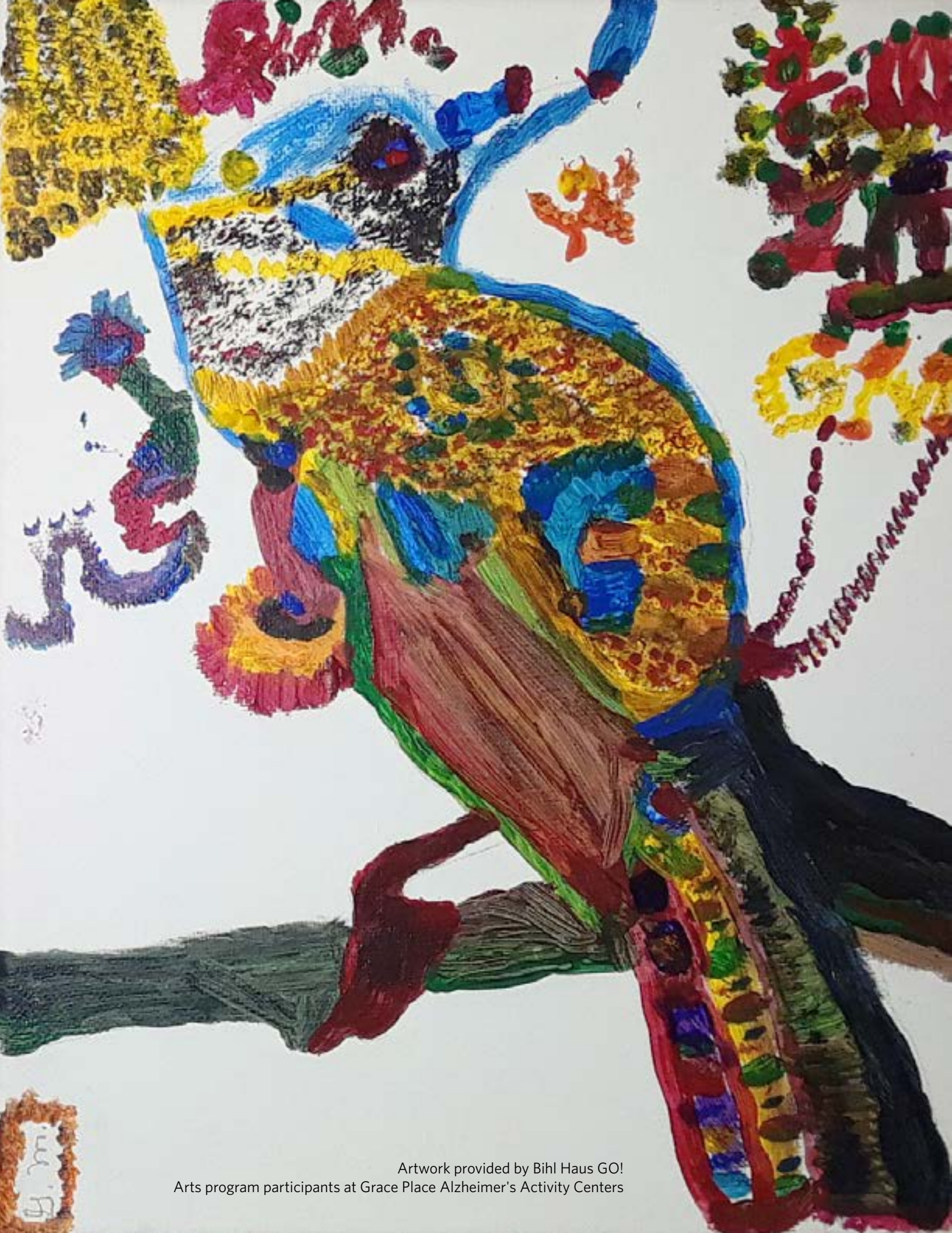
Artwork provided by Bihl Haus GO! Arts program participants at Grace Place Alzheimer's Activity Centers