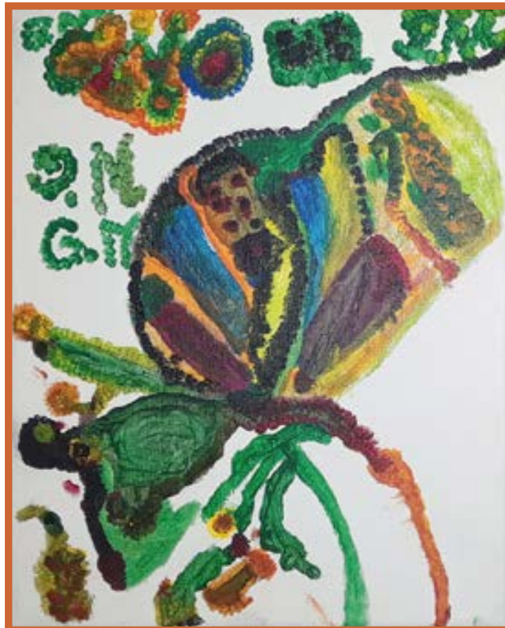
Artwork provided by Bihl Haus GO! Arts program participants at Grace Place Alzheimer's Activity Centers