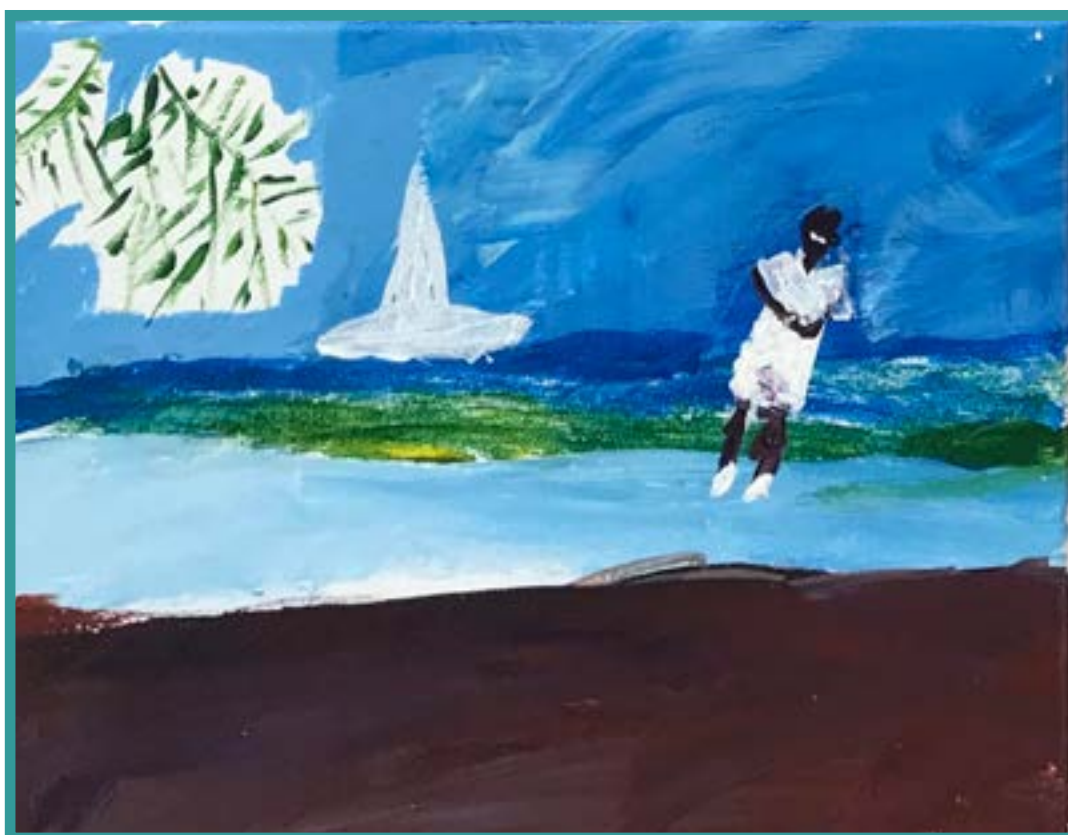
Artwork provided by Bihl Haus GO! Arts program participants at Grace Place Alzheimer's Activity Centers