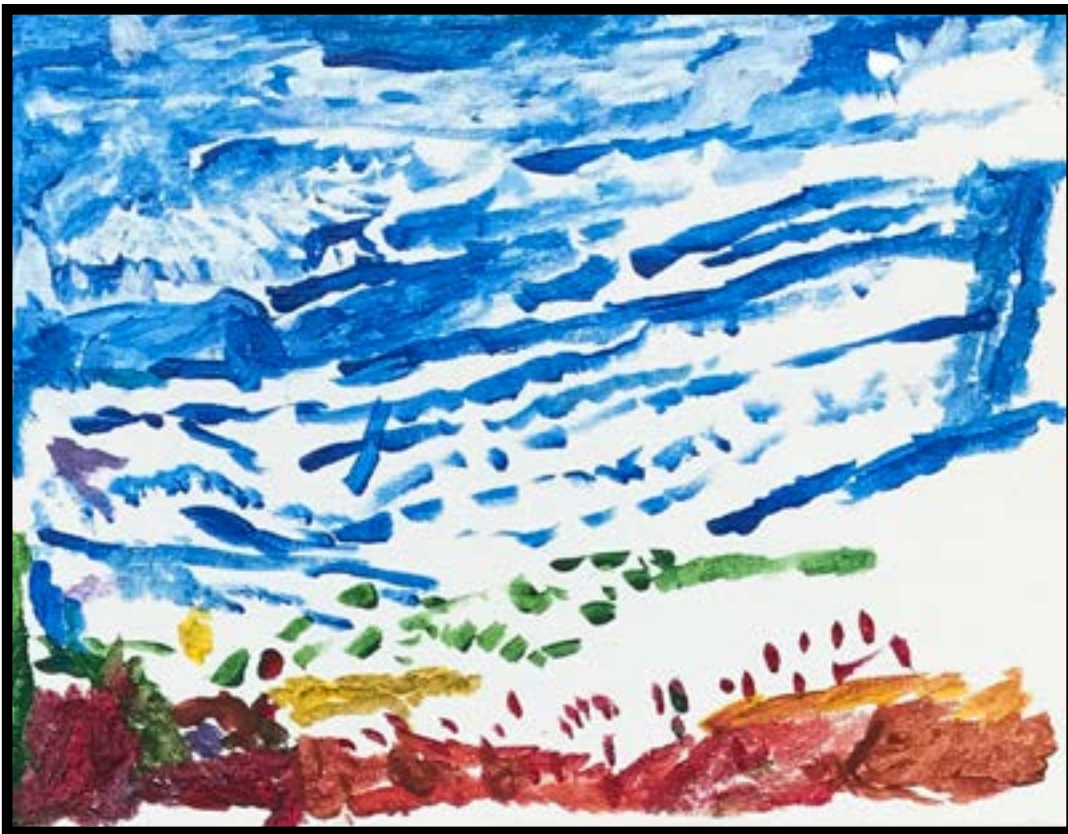
Artwork provided by Bihl Haus GO! Arts program participants at Grace Place Alzheimer's Activity Centers