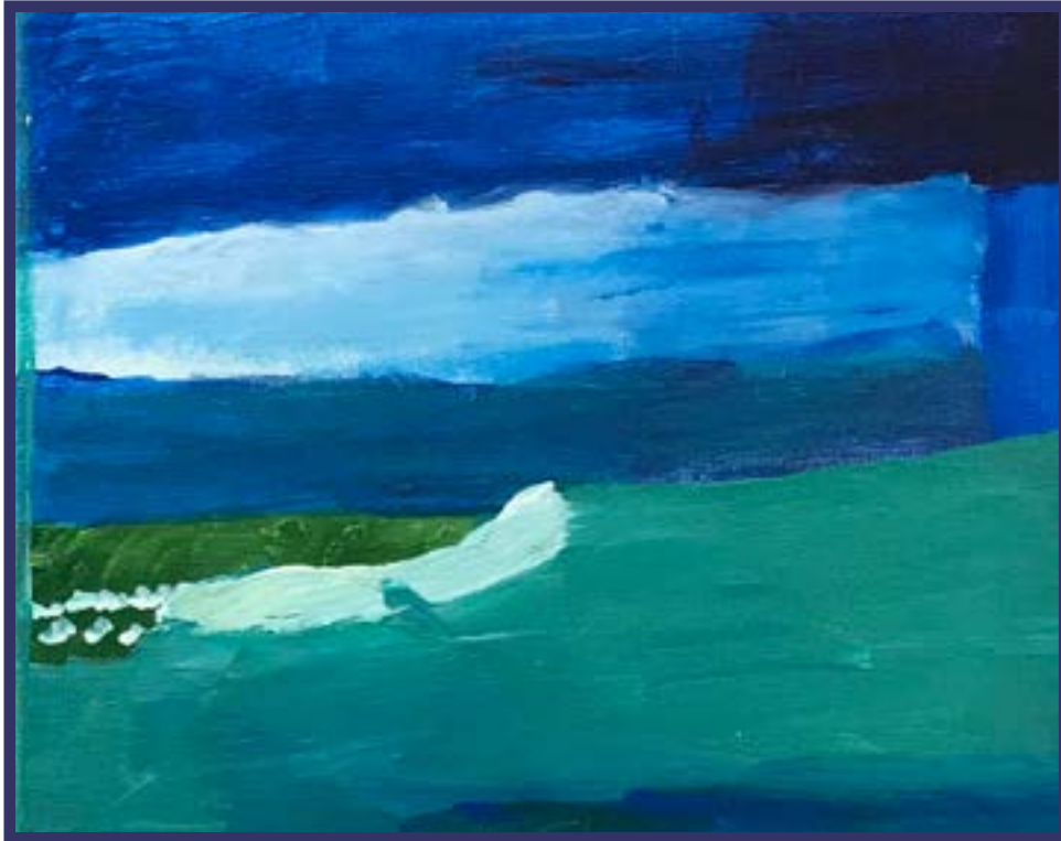
Artwork provided by Bihl Haus GO! Arts program participants at Grace Place Alzheimer's Activity Centers